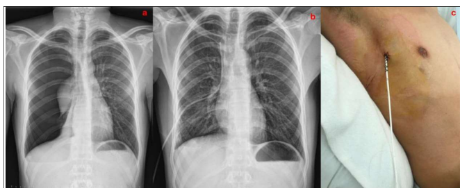
Figure 2: A patient with a primary spontaneous pneumothorax who was accepted as unstable, and underwent drainage with 8F catheter: a) right total pneumothorax on lung X-ray at admission, b) appearance of the expanding lung and thoracic catheter on lung X-ray after treatment, c) appearance of 8F thorax catheter.

The obtained data were statistically evaluated with the SPSS (Statistical Package for the Social Sciences version 24.0; SPSS Inc., Chicago, IL, USA) programme. The normal distribution assumption of the data was checked by Kolmogorov-Smirnov test. Descriptive statistics of the data were made. In all statistical analyses, those with p-values less than 0.05 were considered significant. The relationship between the nominal data was examined by multi-chamber tables and Chi-square test. OR ± 95% CI was calculated.