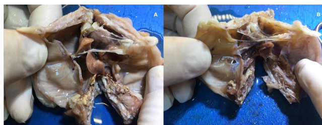
Figure 1. En bloc resection of the whole thoracic wall A) adhesions in ipsilateral hemithorax (rifamycin received group) B) adhesions in both hemithoraces (talc received group)

The rats were kept alive for 4 weeks under appropriate living conditions with optimum temperature and humidity and 12-hour light and 12-hour dark cycles. They were provided with access to water and they were fed with pellet feed. No movement disorders, feeding disorders, or any other pathologies were observed in the rats after the surgical procedures. All of the rats were sacrificed with cervical dislocation under general anesthesia obtained by the administration of 100 mg/kg ketamine hydrochloride and 10 mg/kg xylazine hydrochloride to each rat at the end of the fourth week. En-bloc resection of the whole thoracic wall was performed, dissecting the muscle and connective tissue (Figure 1). After the specimens were washed with saline solution, they were placed in 10% formaldehyde solution.