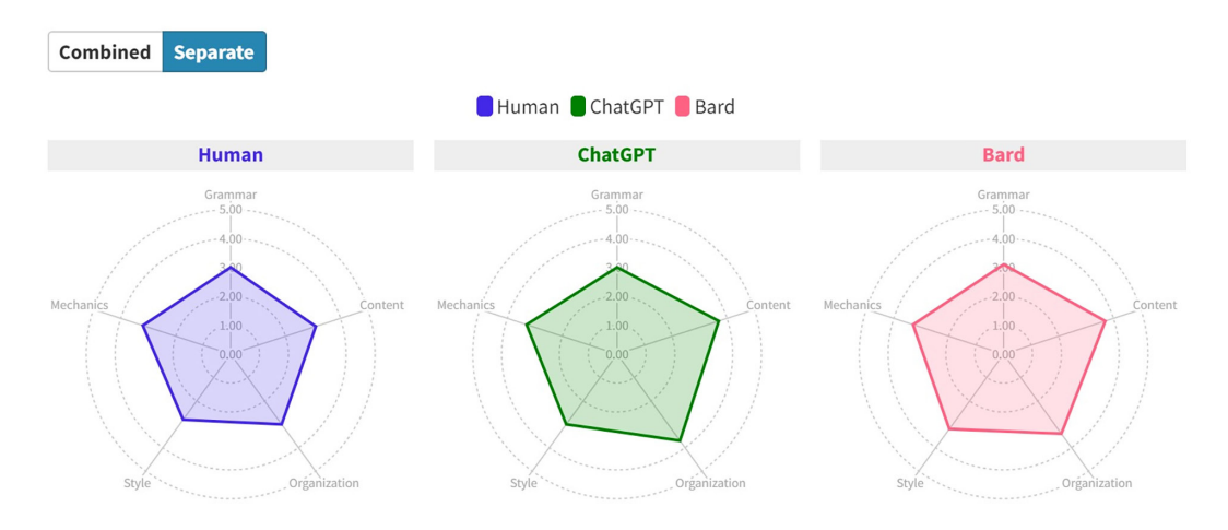
FIGURE 3 Radar chart showing the comparison of grade mean scores according to rubric domains.

Moving onto the content domain, a divergence between humans and LLMs can be observed. The mean score of human raters was 3.1, whereas ChatGPT and Bard assigned a higher mean score (M=3.7). It is notable that the divergence between humans and LLMs is highest in the content domain when compared to other domains. Although the difference is not major (MD=0.6), this divergence signifies a potential area of fine-tuning where LLMs'