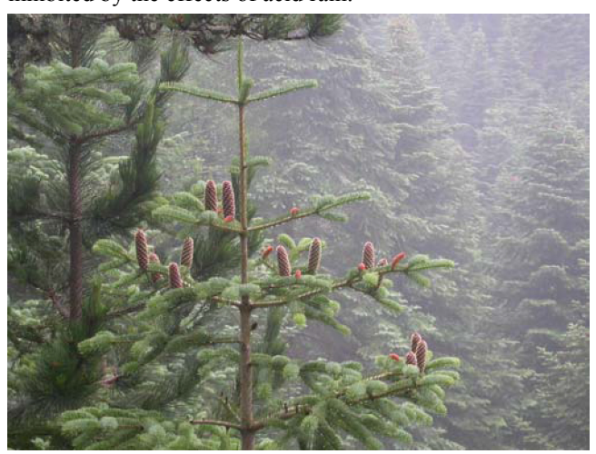
Fig. 6. The air pollution by North winds from thermal power plant located in Çan District, damages especially endemic Kazdağı fir trees ( Abies nordmanniana subsp. equi-trojani ).

damage in roots have been reported. The acid rain, washes the waxy layer on the leaves and makes the plant vulnerable to diseases. Plant germination and reproduction is also inhibited by the effects of acid rain.