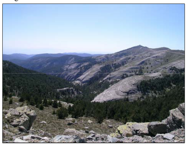
Fig. 3. The Sarıkız hill is visited by hundresds of people daily during the Sarıkız festival.