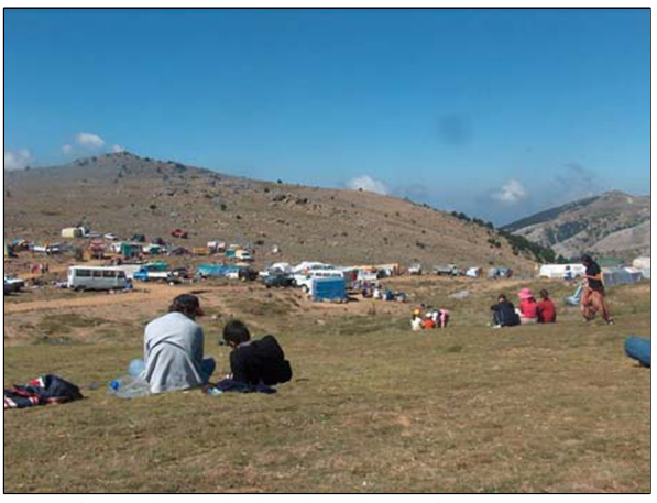
Fig. 4. The Sarıkız Festivale takes place 15th August at summit of Mt. Kazdağı

Gathering Plant and Trade of Plant: Medical and aromatic plant species around the national park have been gathered for commercial purposes by local people. Plant species have been endangered as the result of the unplanned and uncontrolled gathering.