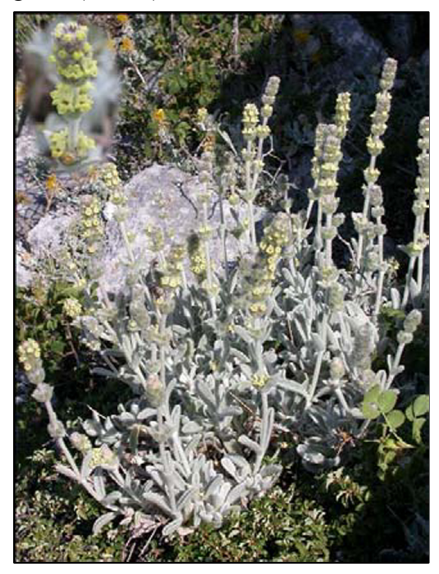
Fig. 5. Sideritis trojana grown only in Kazdağı. The plant is collected and used as herbal tea in regions.

pilosa is rare in Mt. Kazdağı (6, 14). The population of this species is quite poor in its naturally growing areas. Sideritis athoa is also a rare plant, known of only two locations in Turkey (3). The plant is collected and used as herbal tea in both regions (10, 11).