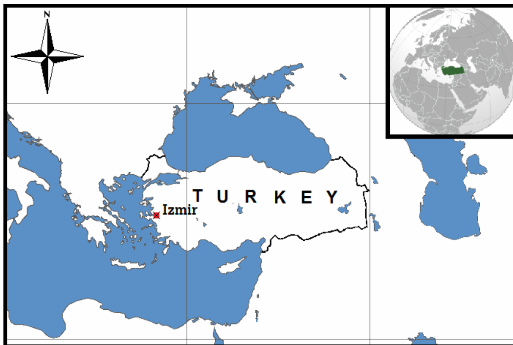
Fig. 1. The map of the study area.

Izmir Province is subject to the influence of the Mediterranean climate, characterized by hot, dry summers and mild, rainy winters. According to the data of the State Meteorology Department, July and August are the hottest and driest, while January and February are the coldest months. Most of the annual precipitation occurs in December and January in the form of rain (Ugulu et al. , 2009).